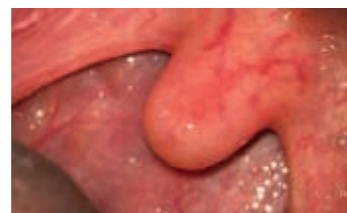
Halogen illumination for standard applications