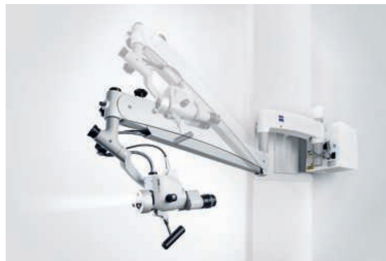
Always ready to go when you are