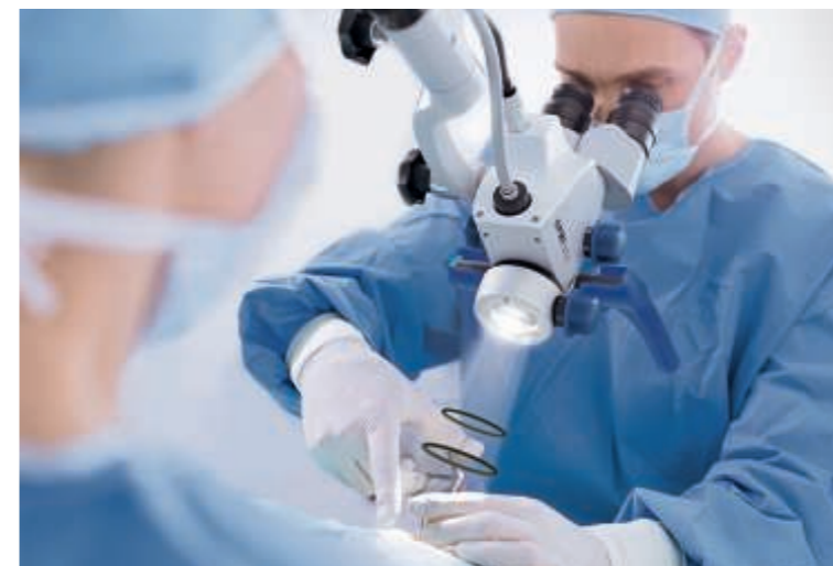
Adjust the focal length during surgery with the Varioskop 100

By providing well-distributed, true-to-color light that strongly resembles natural daylight, LED illumination enables better differentiation of anatomical structures and vessels in a much brighter and clearer way than halogen. Virtually maintenance-free, there is no need to replace light bulbs, thereby helping to reduce costs. LED illumination enables you to better visualize the region of interest, even in deep and narrow channels.