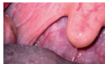
LED illumination for enhanced visibility